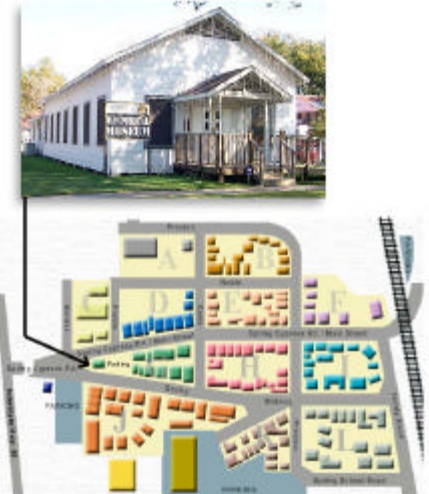
Meet Saturday, May 11th, 11:00 AM at the Old Town Spring Museum for the 1st Annual Woodlands Photography Club Scavenger Hunt

somewhere to give you your assignment card and official WPC press pass (name badge). Anyone, whether club member or not, is welcome to join in. We will share our photographs at the June meeting. Bring prints or slides.