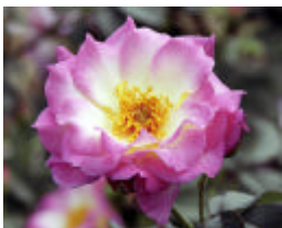
Take a look at the rest of his portfolio at woodlandsphoto.org/~jharper

One of the many benefits of membership in the Woodlands Photography Club is the free web space available