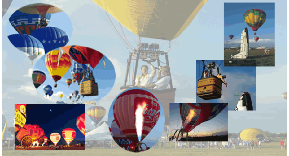
Visit the Ballunar Liftoff 2002 web site at http://www.ballunarfestival.com/