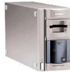
Digital photography will be the subject of the August meeting.