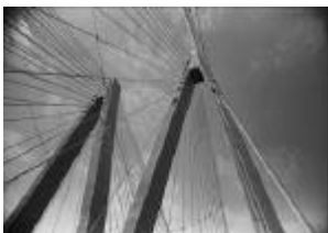
Photo by Dot Mullinax. Take a look at the rest of her portfolio at woodlandphoto.org/~dmullinax

One of the many benefits of membership in the Woodlands Photography Club is the free