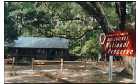
Big Thicket National Preserve

For more information, check out: http://www.nps.gov/bith/ .